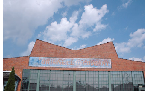
The Grinnell Building features a distinct roof line.

1435 West Morehead Street, Studio 210 (Corner of Summit and Bryant) Charlotte, NC 28208